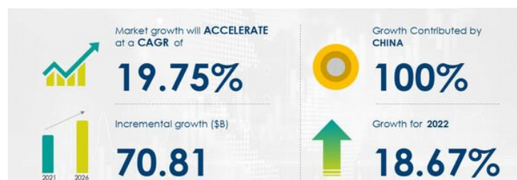
Figure 1.1: English Language Training Market in China 2022-26

Language acquisition, particularly of an internationally recognized language such as English, is increasingly viewed as a means of achieving academic and professional success (Rulona & Bacasmot, 2023). This importance grows in the field of childhood education since it effects cognitive development, communication skills, and future academic trajectories. Therefore, investigating how the adoption of EFL teaching practices corresponds with and improves educational quality in the Chinese early education system becomes crucial. The study intends to shed light on the efficacy of EFL teaching practices as a catalyst for holistic educational development during the early years of a child's learning journey in China by exploring this relationship.